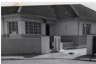
33 Lawrence Road

Together, Selig and Peisach started a shoe factory in Maitland, Olympic Footwear, on the right-hand side of Voortrekker Road heading towards Salt River.